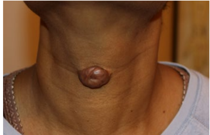
Figure 5. Case Study 1 - A 55-year-old African American female with a 3-centimeter tumoral keloid in anterior neck.

This tumoral keloid was treated with contact cryotherapy once every two months. Near total ablation was achieved after three cycles (Figure 6). Four years later, the treated area remains free of recurrence.