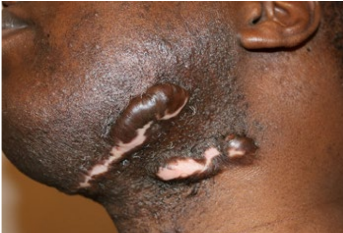
Figure 14. Case Study 2, same patient, January 2016. Recurrent disease after cryotherapy.