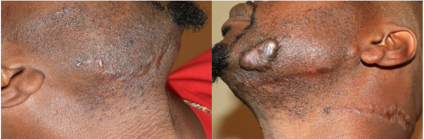
Figure 25. Case Study 6, one year after surgical removal of the tumoral keloids with continued post-operative adjuvant treatments with ILC and ILT.