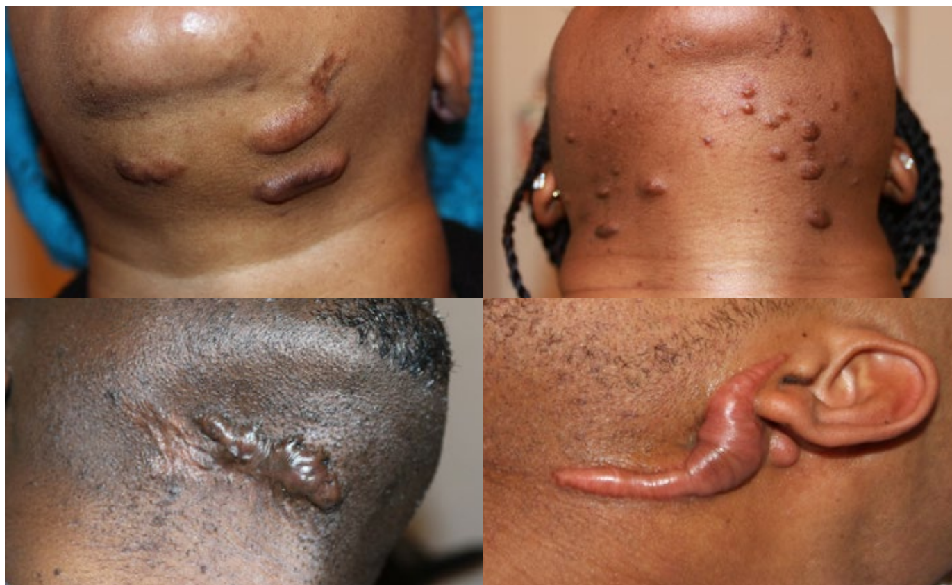
Figure 7. Four examples of locally advanced neck keloids. Treating each one of these patients will require a thoughtfully designed long-term plan of care.