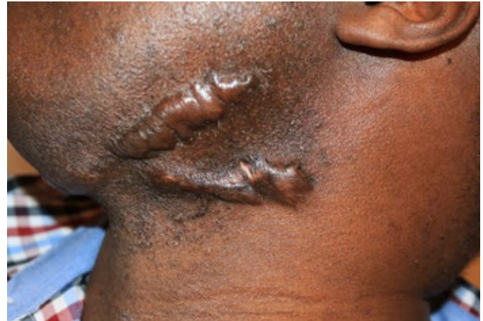
Figure 16. Case Study 2, recurrent disease after repeat surgery and radiation therapy (January 2018).