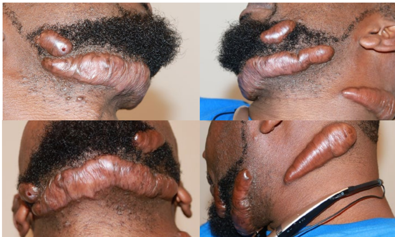
Figure 24. Case Study 6, Recurrent keloids along the surgical excision lines.

After much consideration, and with the limitations imposed by his work and his work schedule, he was started on ILC treatment with minimal response. In September 2017, almost two years after his initial presentation, he was referred for debulking surgery with the intention of aggressive post-operative adjuvant medical treatments. Figure 25 depicts the status of his neck keloids as of October 2018, approximately one year after the debulking surgery. Since his last surgery, he has been treated with ILT and ILC once every 6-8 weeks. The tumoral keloid on the left side of his face was not removed surgically due to technical issues related to approximating of the edges of the surgical wound. The patient's work schedule has not allowed for cryotherapy to this lesion.