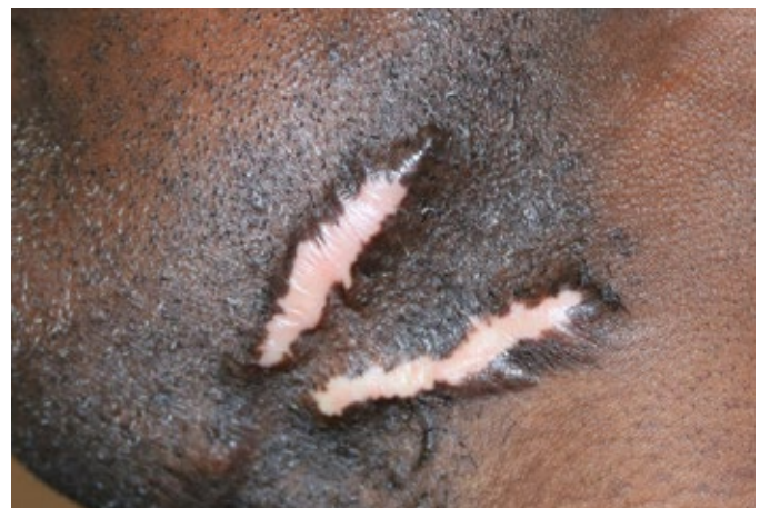
Figure 17. Case Study 2, debulking achieved with cryotherapy (March 2018)

After the April 2016 visit, the patient did not return for follow up until January 2018 (Figure 16). Since his last visit, in late 2016 he elected to undergo repeat surgery followed by radiation therapy with hopes and promises of a cure. Unfortunately, this intervention was unsuccessful. The patient returned to the author for further treatment. Both lesions were once again treated with cryotherapy. Figure 17 depicts the results achieved by March 2018.