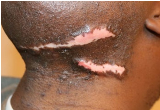
Figure 15. Case Study 2, noticeable debulking was achieved with repeat cryotherapy (April 2016).