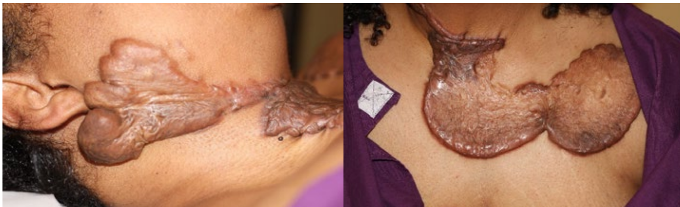
Figure 22. Case study 4, a 36-year-old old African American female with massive neck and chest keloids. Note that the neck keloid has merged with the superficially-spreading keloid on her chest.