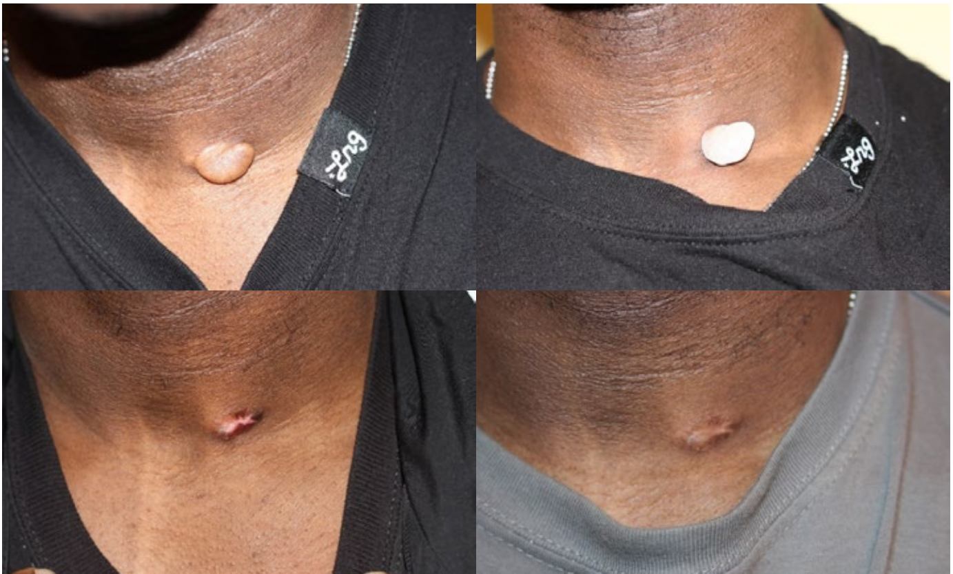
Figure 9. A 21-year-old male who presented with a 2 cm anterior neck keloid tumor in May 2011 (9a). The tumor was treated with contact cryotherapy in the same session (9b). Significant debulking was achieved by October 2011 (9c) with cryotherapy alone. Figure 9d depicts durable remission in June 2014.