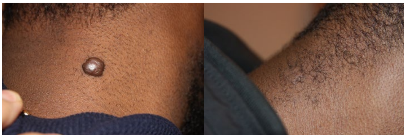
Figure 3. Early-stage nodular neck keloid (3a) in a 24-year-old African American male with a four-year history of keloid disorder also involving his face, anterior neck, ears, and chest. This lesion was treated twice with cryotherapy. Figure 3b was taken two years after treatment, showing minimal skin scarring at the site of the treated keloid.