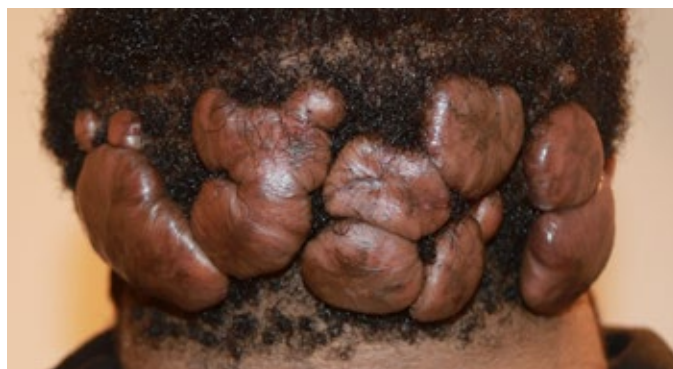
Figure 20. Case Study 3, massive neck keloids in a 25-year-old African American male.