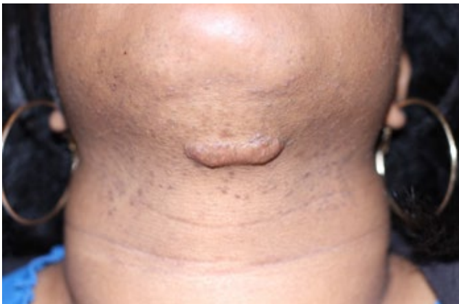
Figure 4. Thick linear keloid of neck in an African American female.

Contact Cryotherapy shall be the first line of treatment for all nodular neck keloids. Any residual keloid tissue that may remain after cryotherapy shall be treated with ILT and/or ILC. Figure 3 depicts durable treatment results with contact cryotherapy.