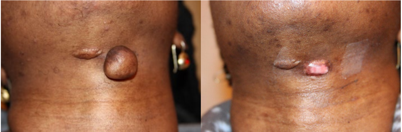
Figure 8. A 3-centimeter tumoral keloid in anterior neck (left). Significant debulking was achieved after one application of cryotherapy (right, three months later).