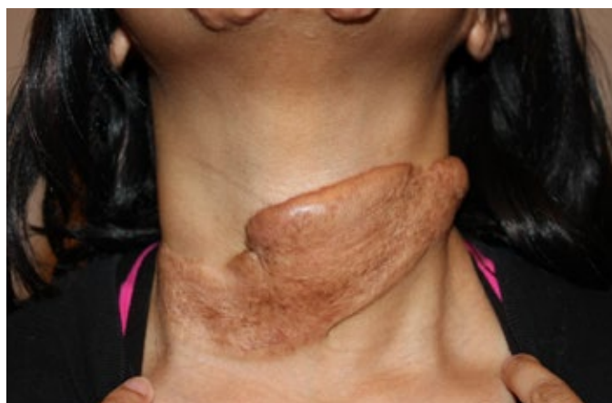
Figure 19. Recurrence of a neck keloid after surgery in a 19-year-old African American female with extensive keloids involving her ears, neck, and pubic areas. She has been struggling with keloid disorder since she was one year old and has undergone numerous surgeries to remove several of her keloids, with most worse after surgery.