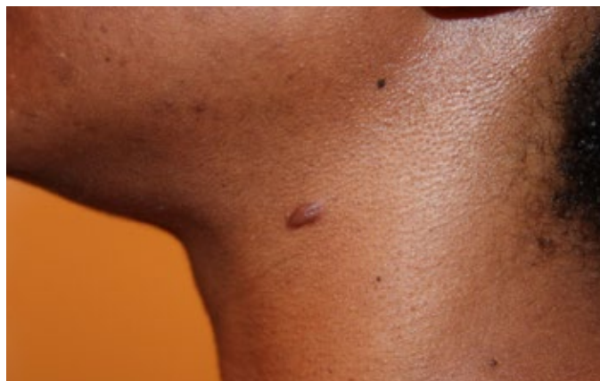
Figure 1. Early-stage papule keloid in a 32-year-old African American female with a 10-year history of keloid disorder, involving her chest and shoulders as well.

or ingrown neck hair (Figure 1). If left untreated, these lesions can grow to become nodular keloids.