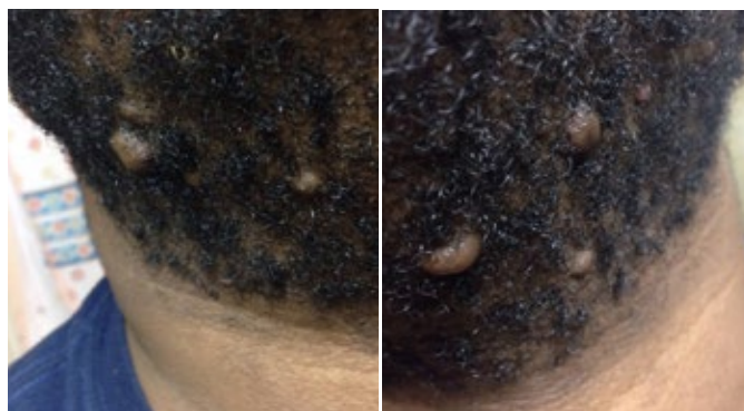
Figure 21. Case Study 3, multiple nodular keloids in submental area three years prior to current presentation and shortly before undergoing the first surgical excision.

As for clinical management of patients like the one presented in this case study, all these patients ideally need a systemic form of treatment. It is extremely difficult to manage these patients with local treatments.