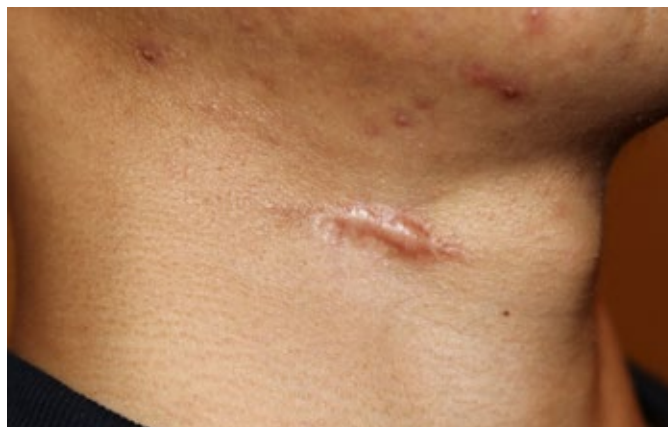
Figure 2. Early-stage linear neck keloid in a young Asian male. This lesion was triggered by surgical removal of a mole. A keloid formed at the site of mole removal surgery. The keloid was then excised and the surgical wound was treated with ILT, yet the lesion shown here evolved despite adjuvant interventions. This patient had no other keloids.