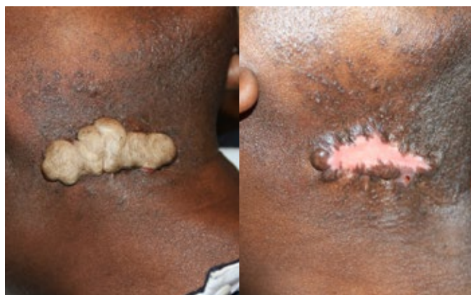
Figure 11. Same patient as in Figure 10 immediately after application of contact cryotherapy (left - the frozen keloid appears white). Significant debulking was achieved within seven weeks of cryotherapy (right). The remnant of this keloid obviously needs further treatments to achieve better results.