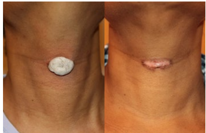
Figure 6. Case Study 1 - Neck keloid immediately after application of topical cryotherapy (left, the frozen keloid appears white) and six months later (right) after three cycles of cryotherapy.

For lesions on a path to becoming bulky, the author recommends contact cryotherapy to reduce the bulk of the lesion. Once the mass of the lesion is reduced, treatment with single-agent ILT should be initiated and continued to control the base of the lesion and to prevent recurrence. The frequency of the ILT injections varies from patient to patient, but should be optimized to keep the disease process under control.