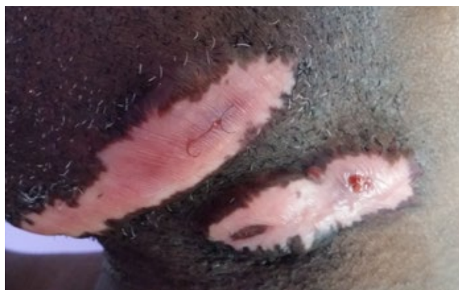
Figure 13. Case Study 2, significant debulking after one course of contact cryotherapy.

In May 2014, both keloids were treated with contact cryotherapy once (see KRF Guideline - Cryo). Significant debulking was achieved by July 2014 (Figure 13).