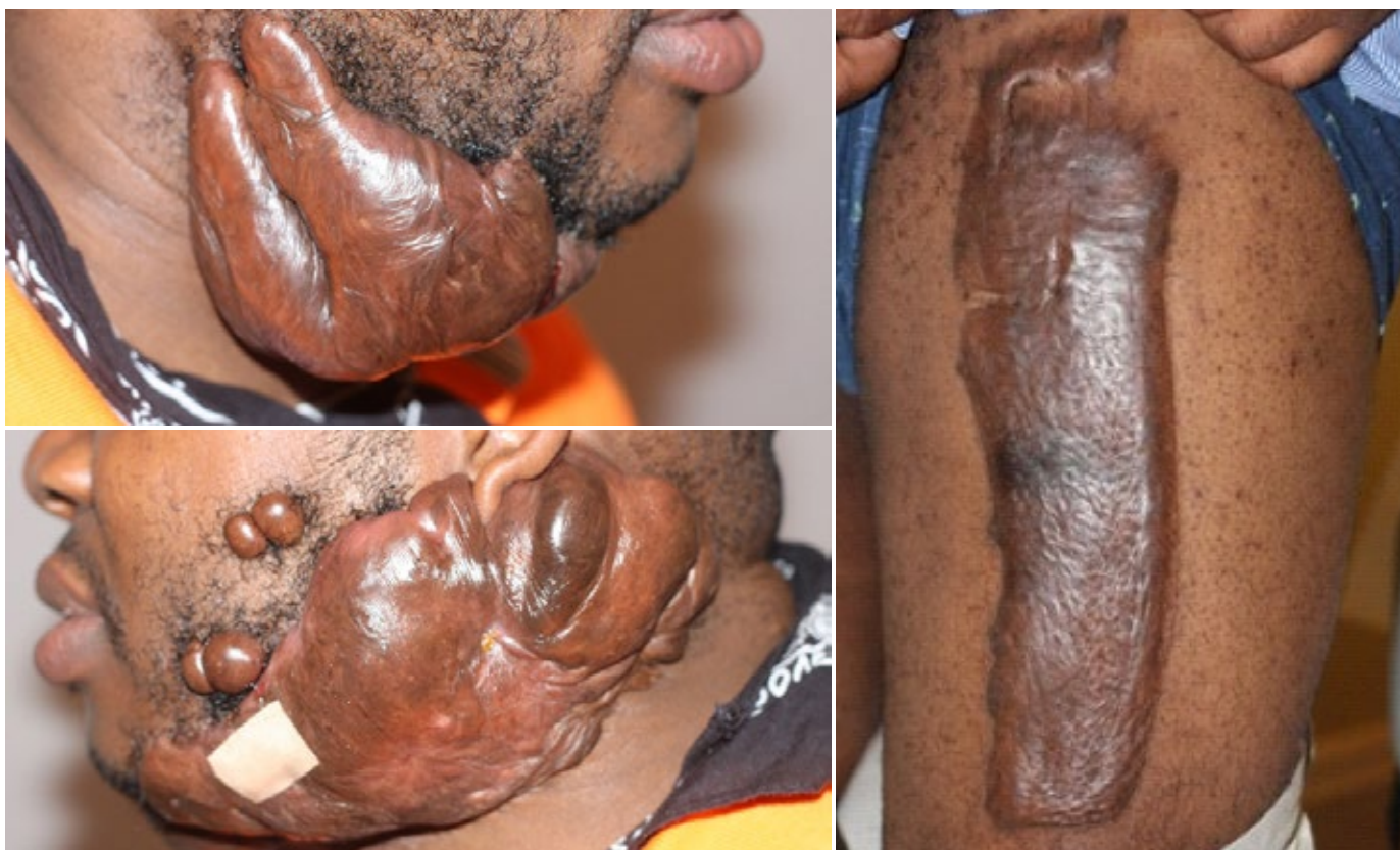
Figure 23. Case study 5, a 31-year-old African American male with super-massive neck keloid and an iatrogenic thigh keloid that developed at the site of donor skin for the skin graft taken to cover the surgical defect created in his neck.

All previous surgeries resulted in the worsening and progression of his disease. The last surgery was performed in 2004, and was followed with adjuvant radiation therapy. Due to the size of his neck keloid, the post resection submandibular skin defect had to be closed using a skin graft. This attempt led to the development a new keloid at the donor site on his thigh, an iatrogenic keloid (Figure 23). After all these efforts, this young man simply gave up on all further treatment.